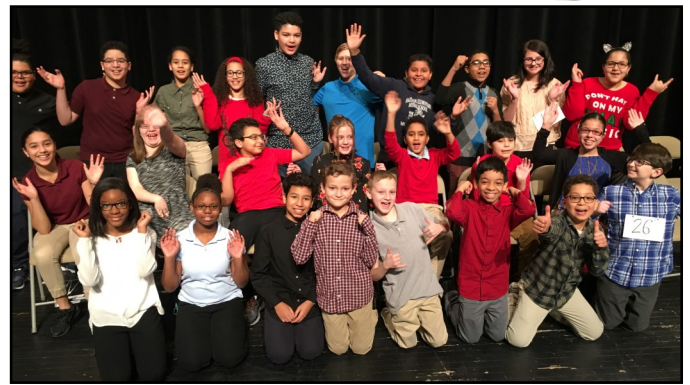
Left: Middle school spelling bee contestants pose and cheer with pride after the HMS spelling bee held on Dec. 20, 2018. Right: Sixth grade contestants celebrate after participating in the spelling bee for the first time.