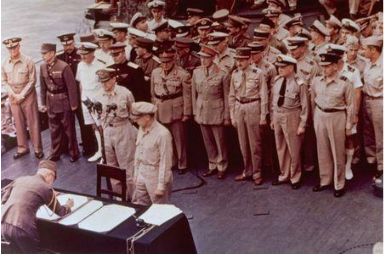
Representatives of the Japanese government sign the surrender document on the deck of the battleship USS Missouri in Tokyo harbor on September 2, 1945.