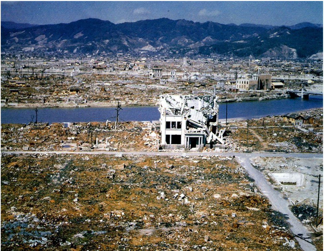
The photo of Hiroshima above was taken eight months after the attack. Water in the Ota River boiled during the blast.