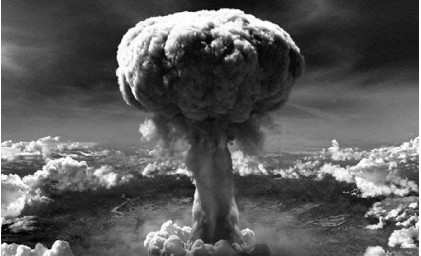
An atomic bomb was dropped on the Japanese city of Hiroshima on August 6, 1945.

Battle of Okinawa- Harry S. Truman- Potsdam Conference- Manhattan Project- ultimatum- USS Indianapolis- Enola Gay- Hiroshima- Nagasaki-