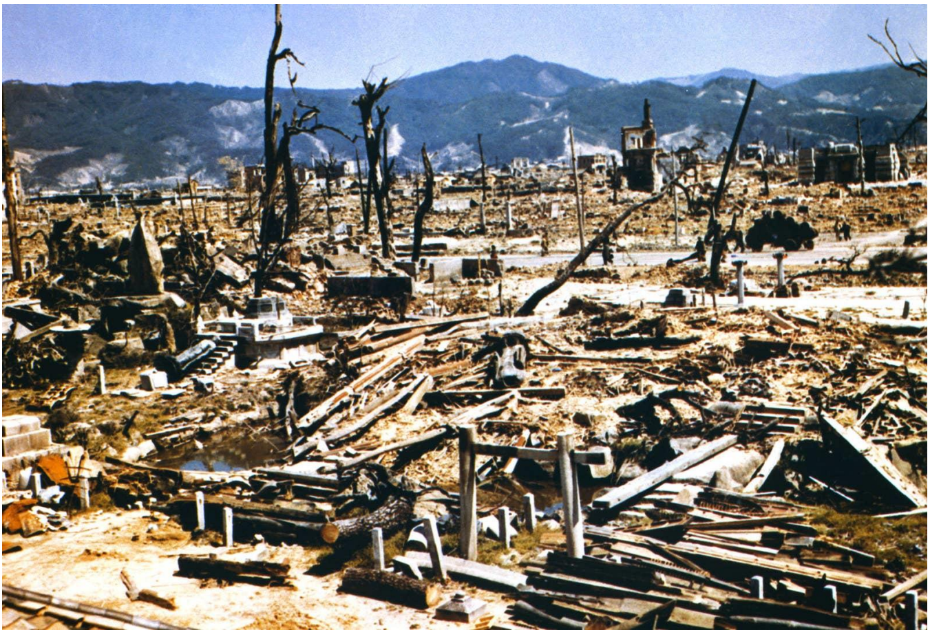
In August of 1945, Nagasaki, Japan, like Hiroshima, was obliterated by an atom bomb. Only a few reinforced concrete buildings remained standing after the blast. Everything else was blown away.