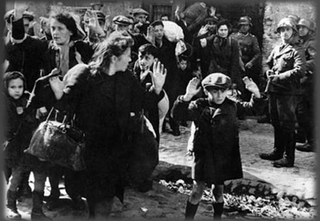
Ghetto in Warsaw, Poland