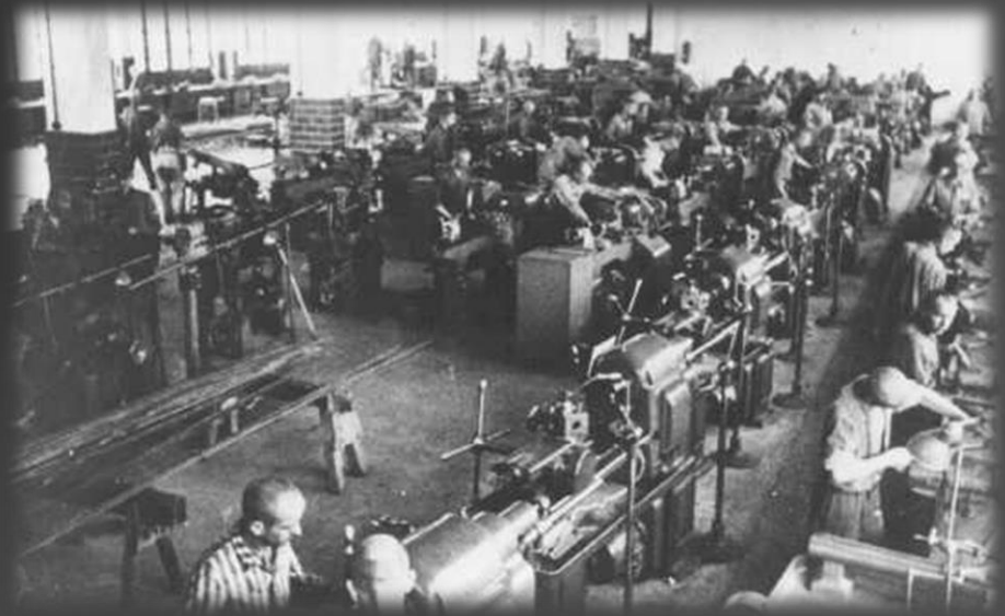
Prisoners at forced labor under SS guard in an armaments factory. Dachau concentration camp, Germany, 1943.