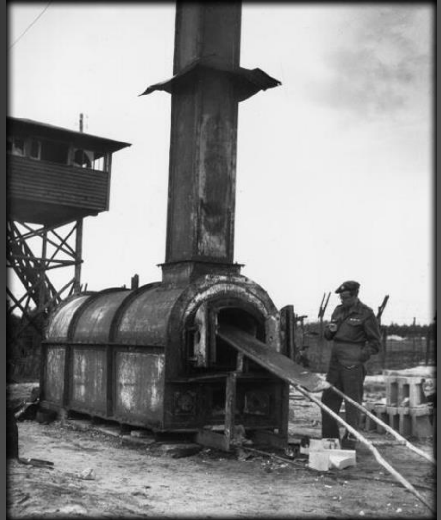
Bergen-Belsen Crematorium Oven